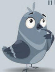
Dove with broken wing

In addition, doves are constantly looking for food. But because there is a feeding ban in Kiel, they don't get enough food. So they just pick up everything they can find. Of course, this is not always healthy and many doves get diarrhea from it. Others just don't find anything to eat and they eventually starve to death.